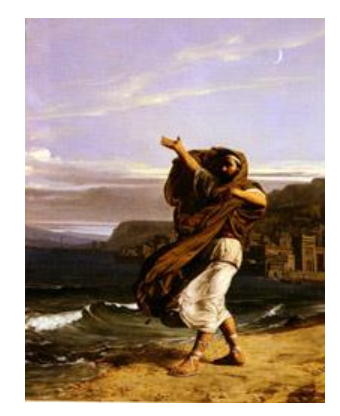
Demosthenes Practising Oratory (1870)

Pick out 1-3 things that interest you, that are related to the class, that you think might make a good Class Project. This Project is something with which you should be able to have fun .